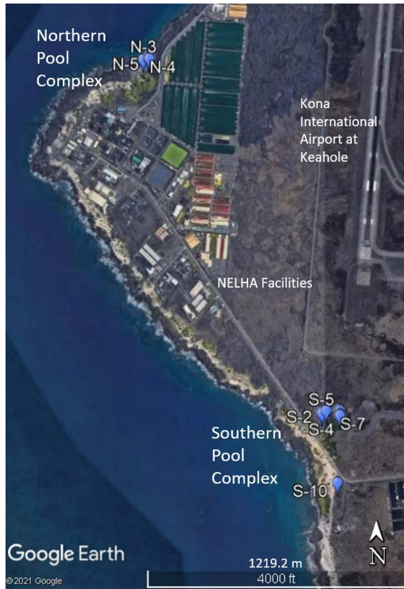
Figure 1. Overview of the study area, which includes Northern and Southern anchialine pool complexes in the vicinity of the NELHA facility. For this annual report, the pools were surveyed from May 21 to June 3, 2024. (Map generated using Google Earth Pro 7.3.3.7786).