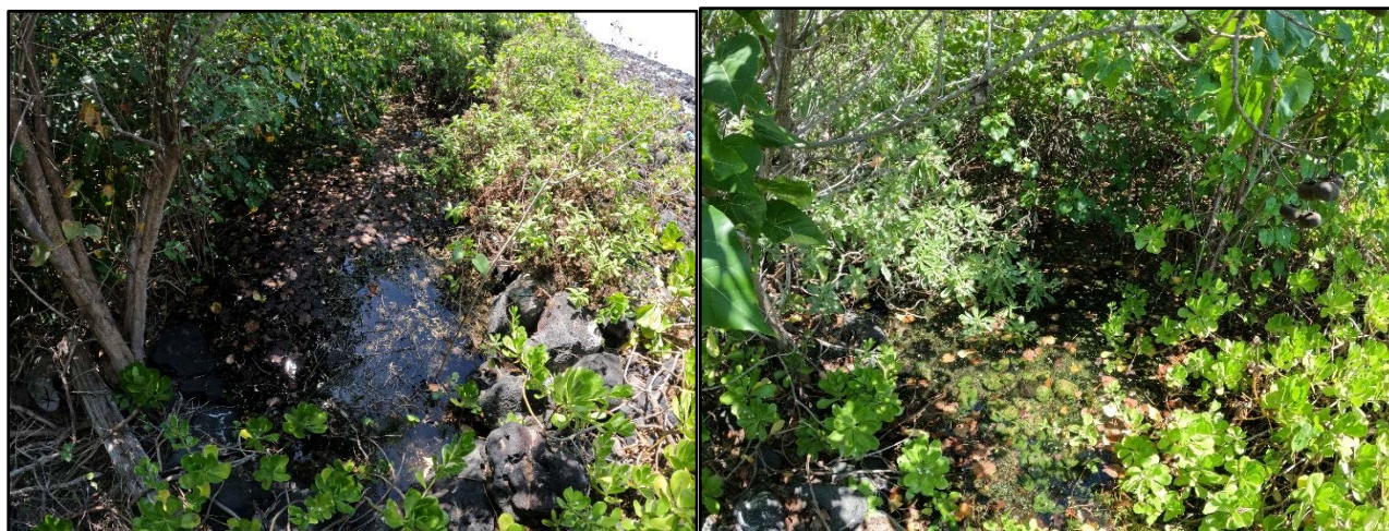
Figure 4. (left) Northern pool, N - 1 at a tide level of +2.44' with leaf litter floating on the surface of the pool and (right) vegetation around pool.