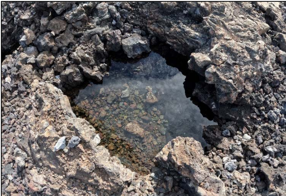
Figure 11. Southern pool S-5 at a tide level of +2.16'.