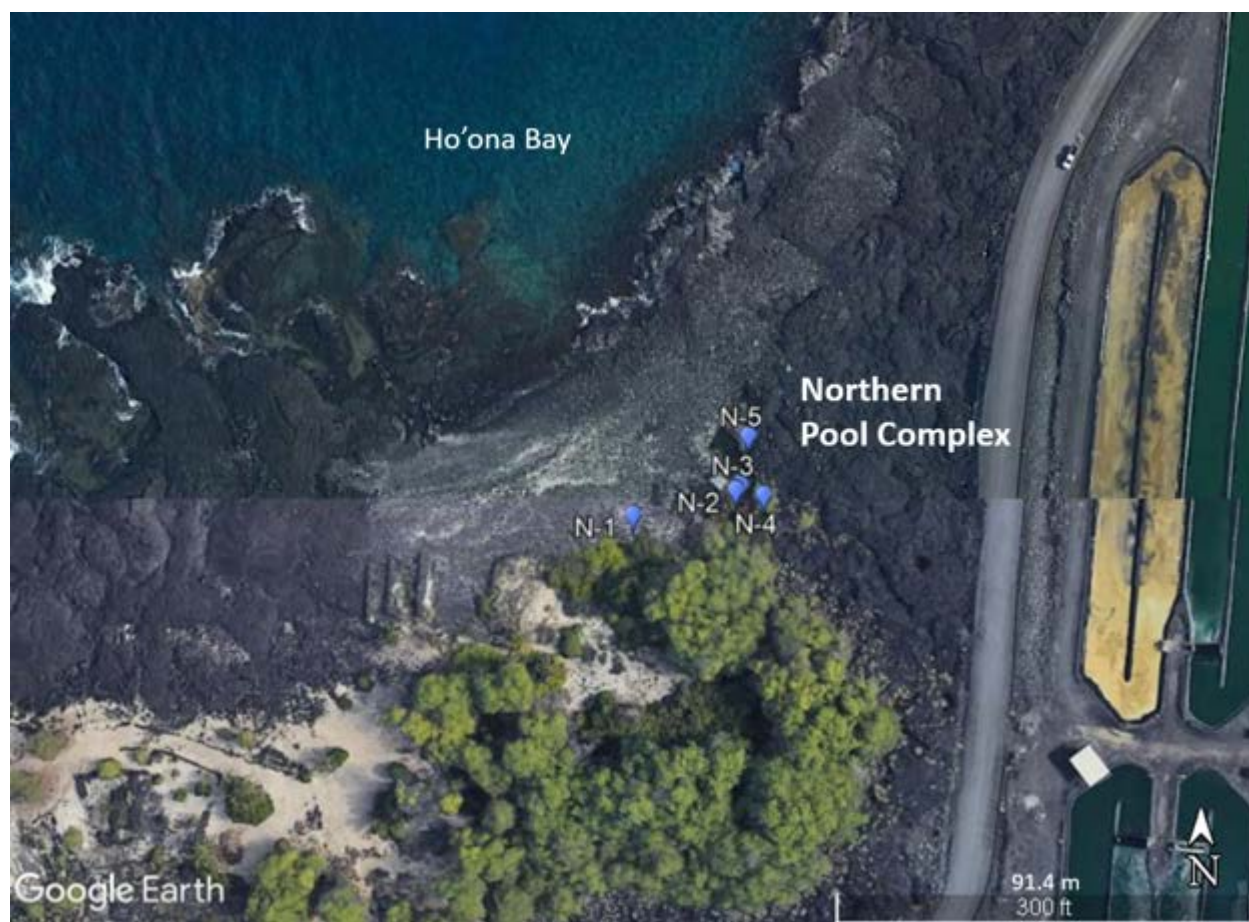
Figure 2. Locations of the Northern complex of anchialine pools (N – 1 through N –5), located inland of the cobble beach at Ho'ona Bay. The Northern pools were surveyed on June 3, 2024. (Map generated using Google Earth Pro 7.3.3.7786).