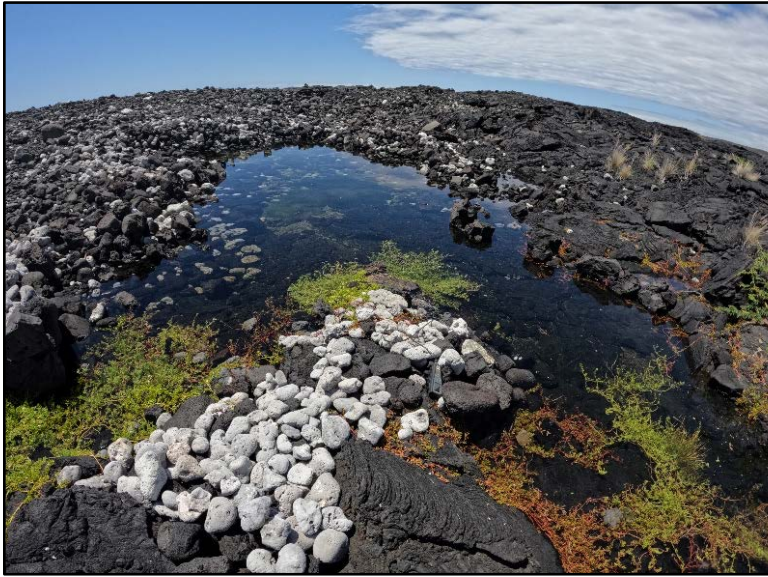
Figure 8. Northern pool N-5, at tide level +1.45'.