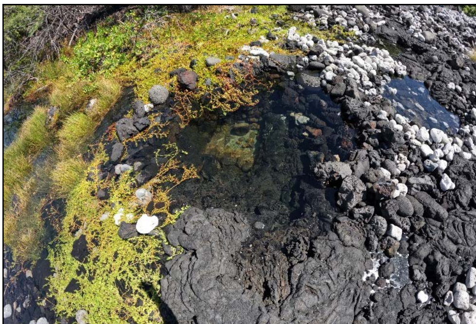
Figure 5. Northern pool N-2, at a tide level of +2.44' connected to N-3 on the left and a new pool forming on the right.