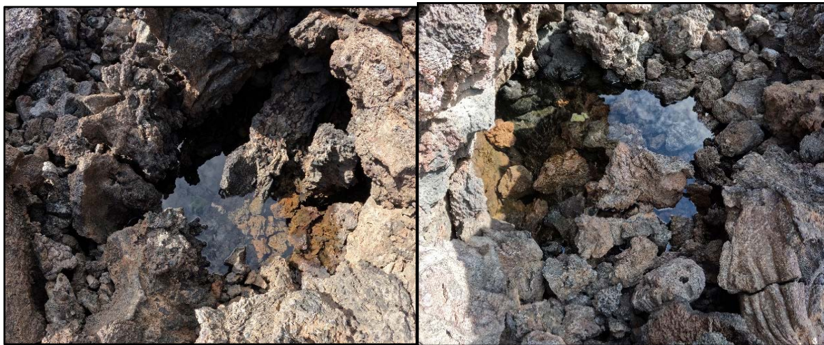
Figure 12. (left) Southern pool S-6 at a tide level of +2.39'. (right) Southern pool, S-9 at a tide level of +2.38'.