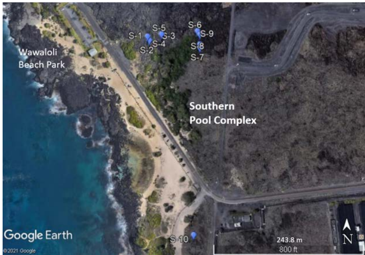
Figure 3. The Southern complex of anchialine pools (S-1 through S-10), located inshore and south of the Wawaloli Beach Park facility at NELHA. The Southern pools were surveyed on May 21 and 22, 2024. (Map generated using Google Earth Pro 7.3.3.7786).