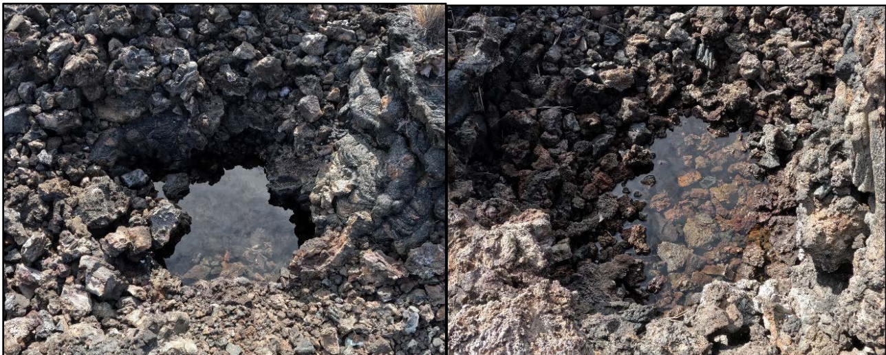
Figure 15. (left) New northern pool just south of pool N-4 at a tide level of +2.15' and (right) new small shallow pool just south of that at tide level of +2.15'.