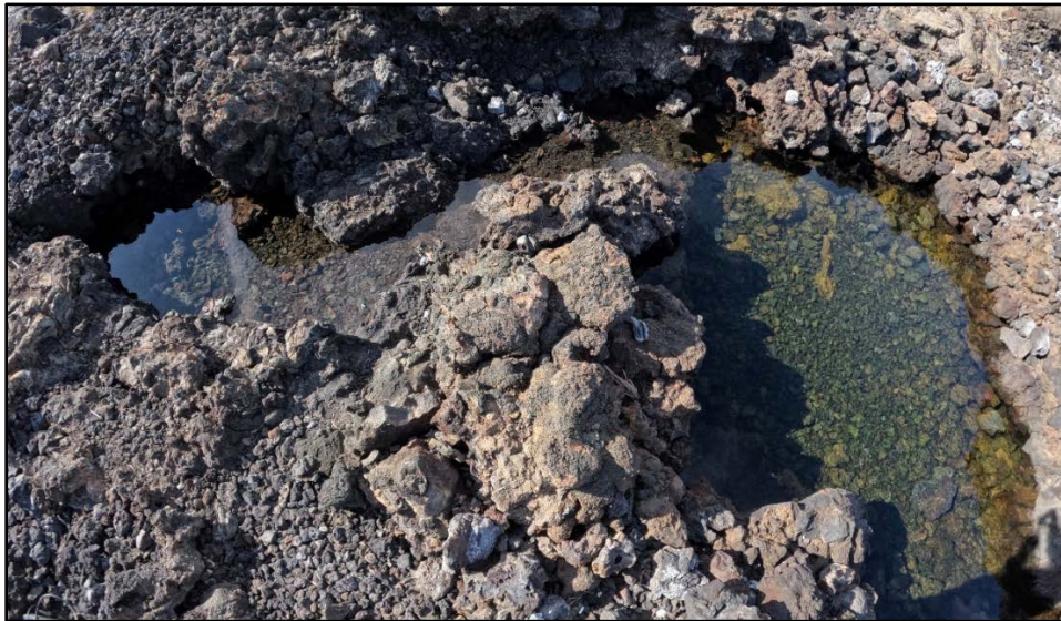
Figure 10. Southern pools, S-3 on the left and S-5 on the right connected at a tide level of +2.19'.