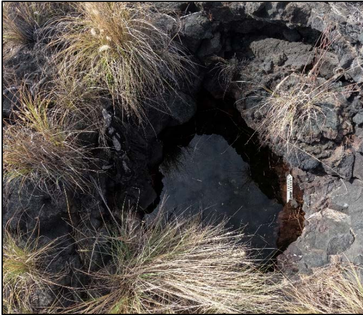
Figure 14. Southern pool, S-10 at a tide level of +1.53'.