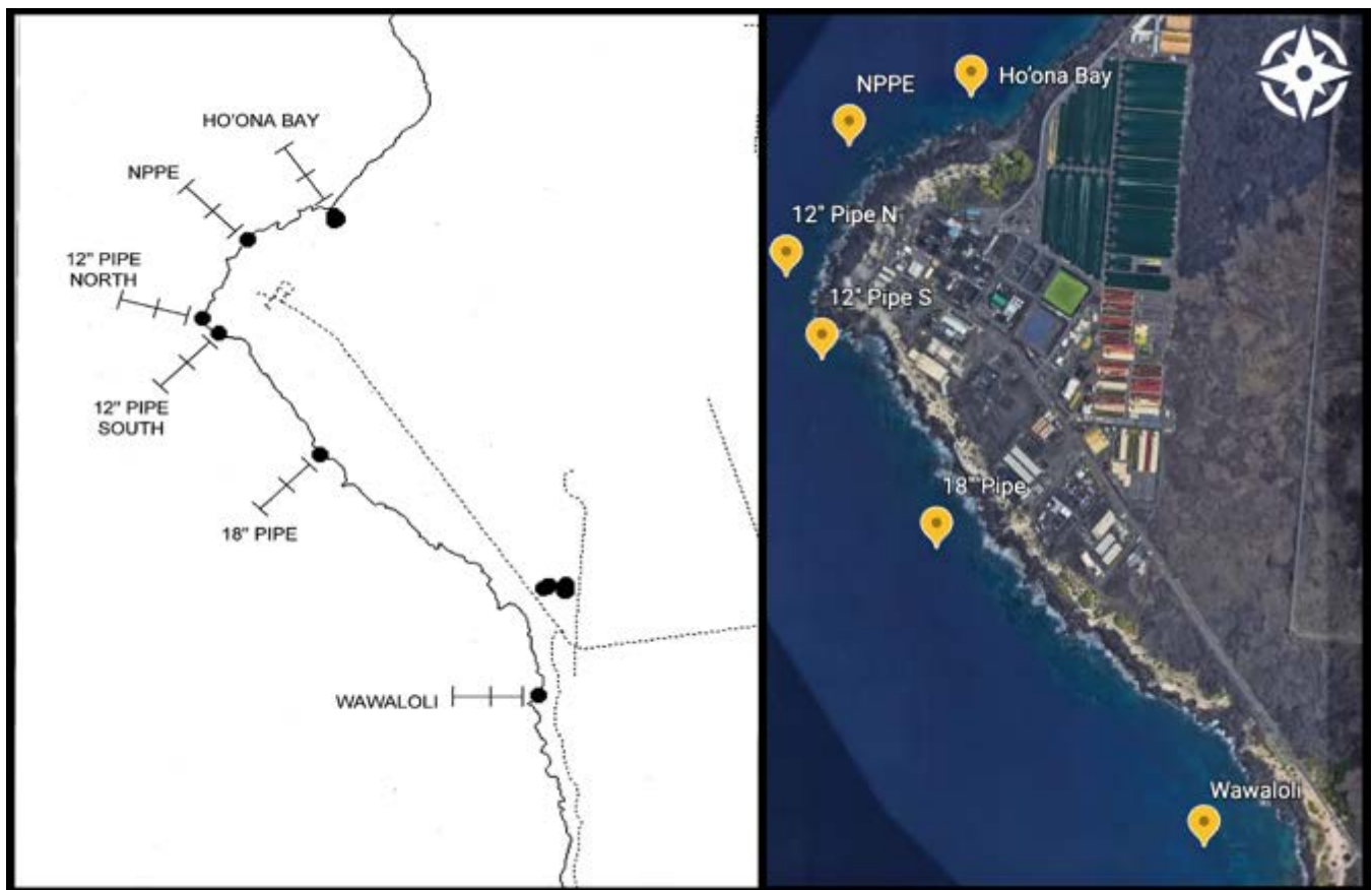
Figure 13. Six stations with three transects per station at deep (~50-fsw), moderate (~35-fsw), and shallow (~15-fsw) depths along the NELHA coastline. A total of 18 transects are completed for both the benthic monitoring and fish assemblage monitoring. An updated map with aerial imagery is provided on the right with North arrow for spatial reference.