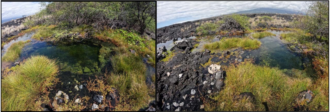
Figure 6. Northern pool N-3 at tide level +2.44' and (right) N-3 connected to N-5 and N-4.