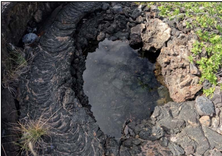
Figure 9. Southern pool, S-1, at a tide level of +2.11'.