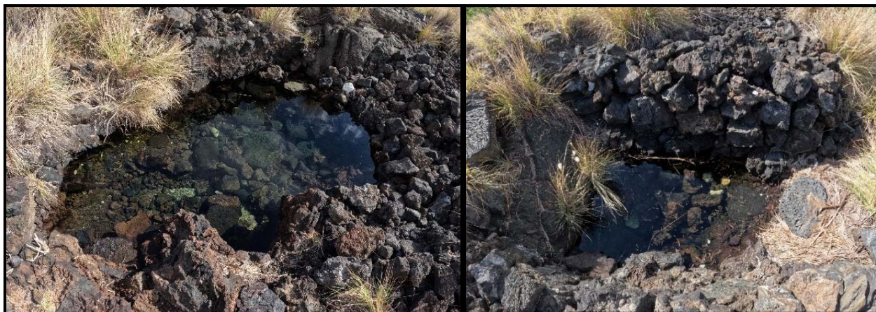
Figure 13. (left) Southern pool, S-7, at a tide level of +2.38'. (right) Southern pool, S-8, at tide level +2.38'.