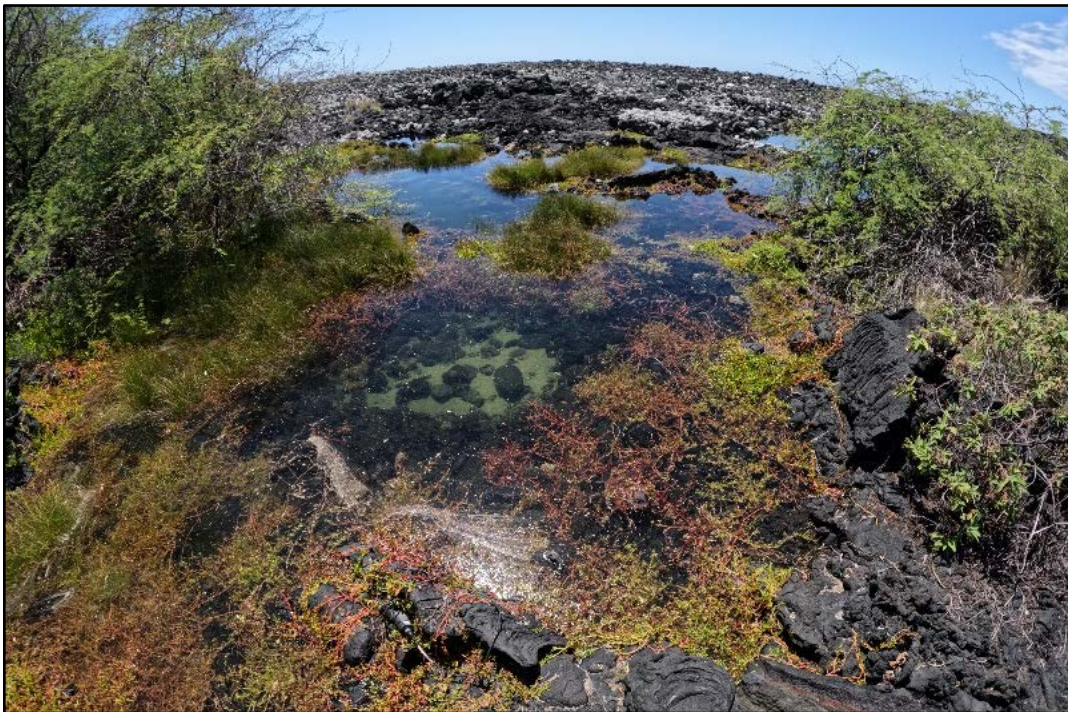
Figure 7. Northern pool, N-4, at tide level +2.42' connected to N-3 and N-5.