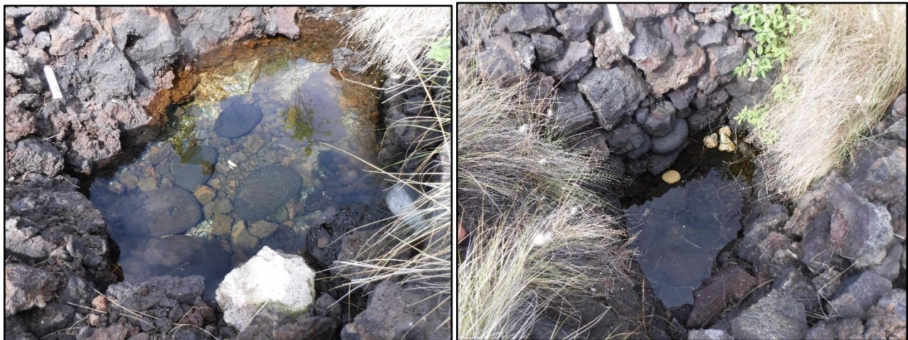
Figure 13. (left) Southern pool, S-7, at a tide level of +0.96'. (right) Southern pool, S-8, at tide level +1.03'.