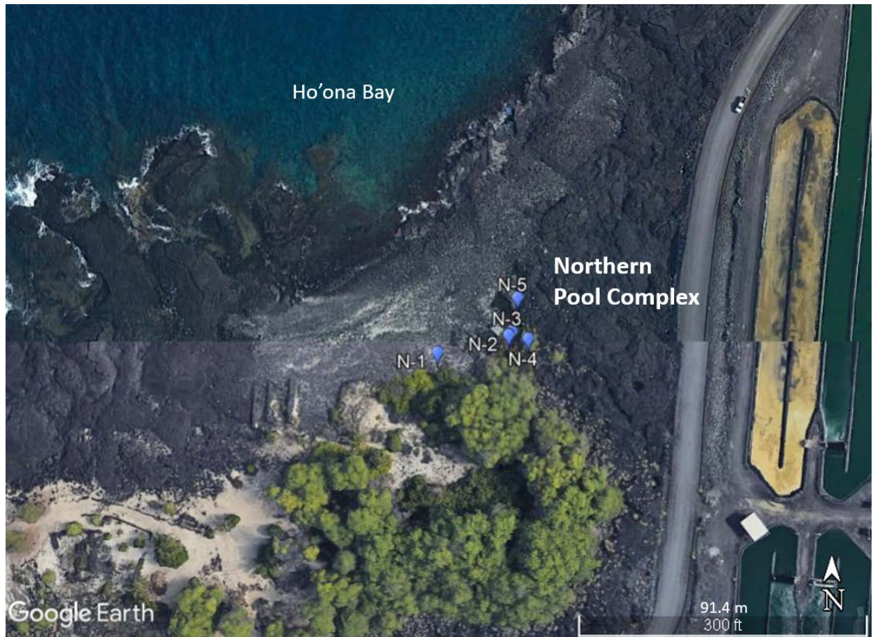
Figure 2. Locations of the Northern complex of anchialine pools (N – 1 through N –5), located inland of the cobble beach at Ho'ona Bay. The Northern pools were surveyed on April 25th, 2021. (Map generated using Google Earth Pro 7.3.3.7786).