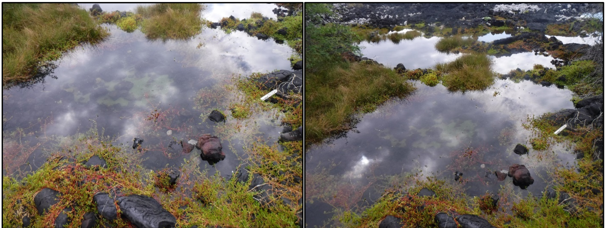
Figure 7. (left) Northern pool, N-4, at tide level +1.68 and (right) N-4 connected to N-3 and N-5.