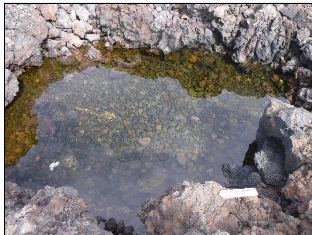
Figure 11. Southern pool S-5 at a tide level of +1.09'.