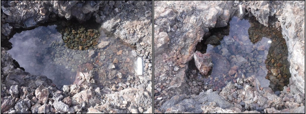
Figure 10. (left) Southern pool, S-3, at a tide level of +2.21' and (right) Southern pool, S-4, at a tide level of +2.20'.