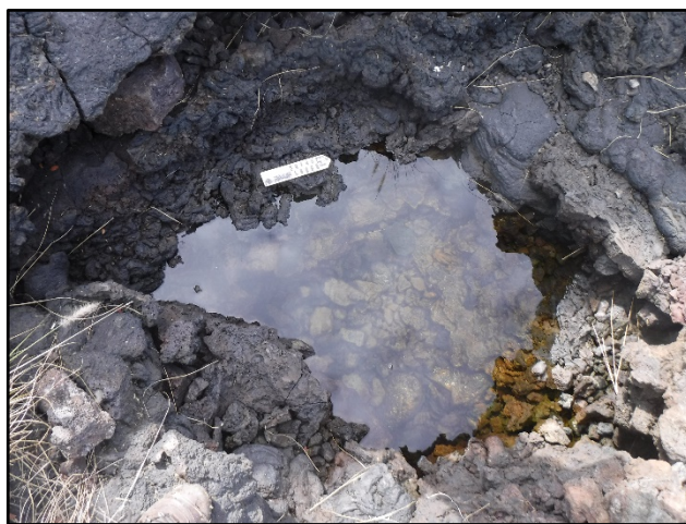
Figure 9. Southern pool, S-1, at a tide level of + 1.13'.