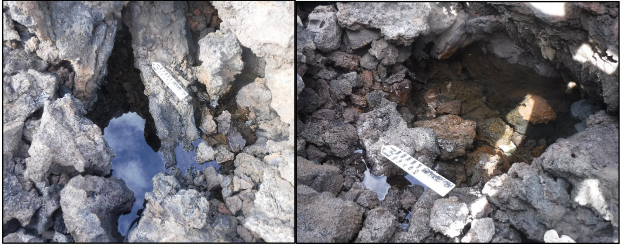
Figure 12. (left) Southern pool S-9 at a tide level of +2.21'. (right) Southern pool, S-6 at a tide level of +2.21'.