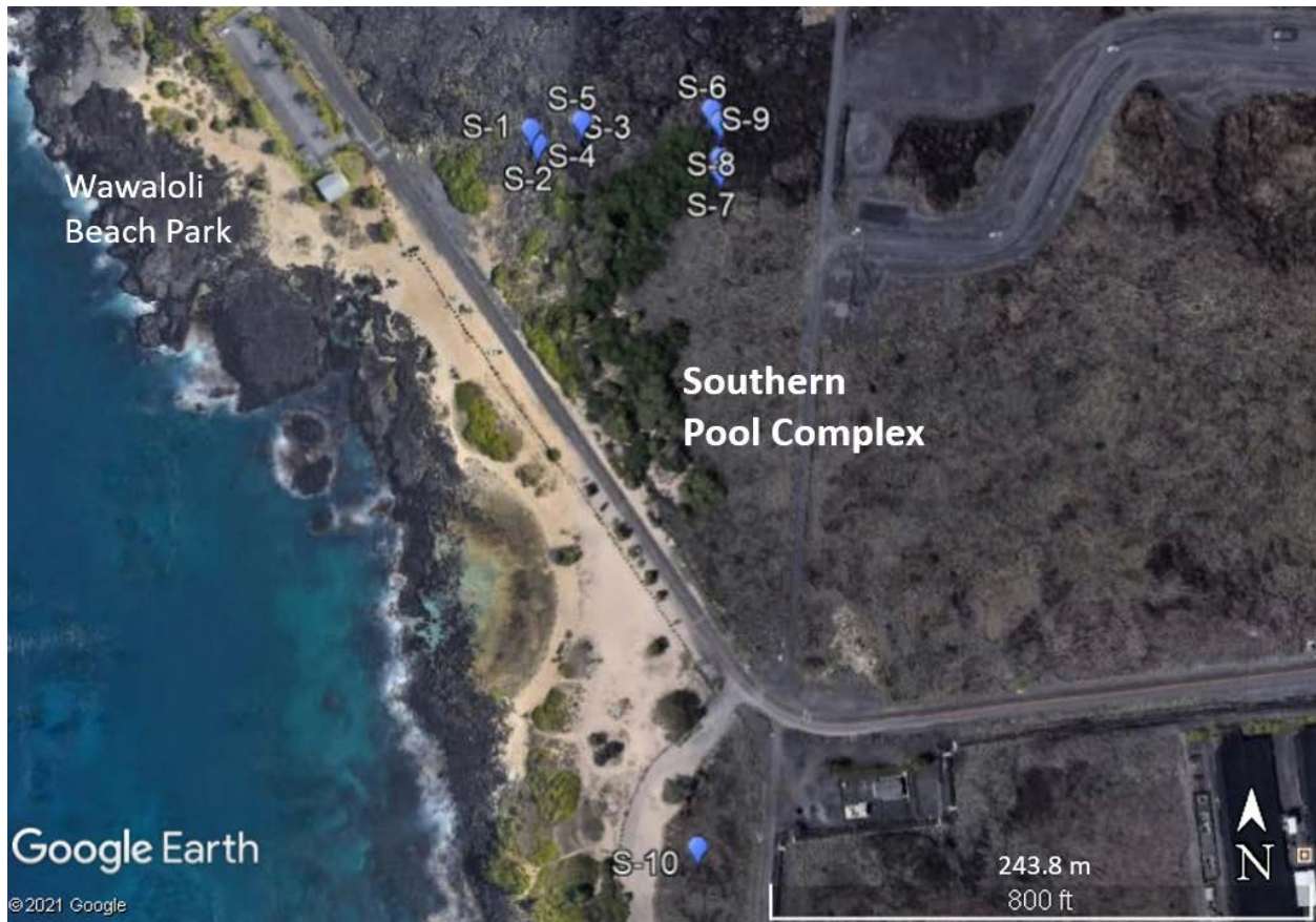
Figure 3. The Southern complex of anchialine pools (S-1 through S-10), located inshore and south of the Wawaloli Beach Park facility at NELHA. The Southern pools were surveyed from March 16th through April 27st 2021. (Map generated using Google Earth Pro 7.3.3.7786).