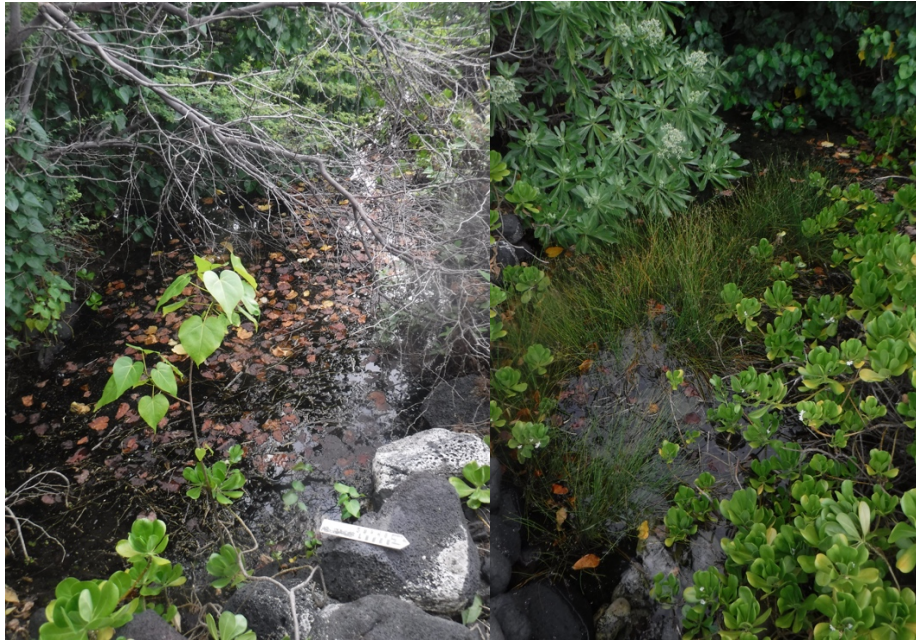
Figure 4. (left) Northern pool, N - 1 at a tide level of +1.61' with leaf litter floating on the surface of the pool and (right) ( Cyperus laevigatus ) growing in pool. Pools in the Northern group were typically characterized by relatively diverse faunal assemblages and dense surrounding vegetation. Surrounding vegetation has continued to encroach pool N – 1.