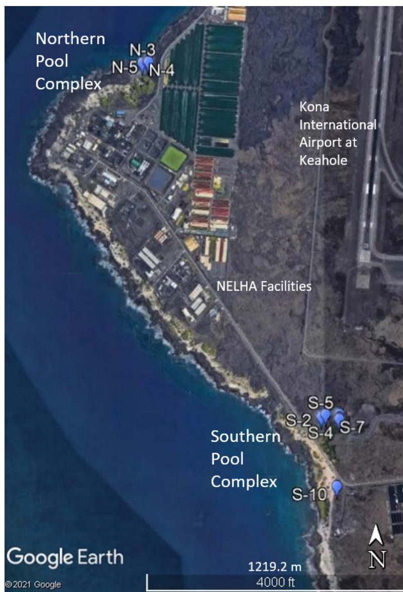
Figure 1. Overview of the study area, which includes Northern and Southern anchialine pool complexes in the vicinity of the NELHA facility. For this annual report, the pools were surveyed from March 16th through April 27st 2021. (Map generated using Google Earth Pro 7.3.3.7786).