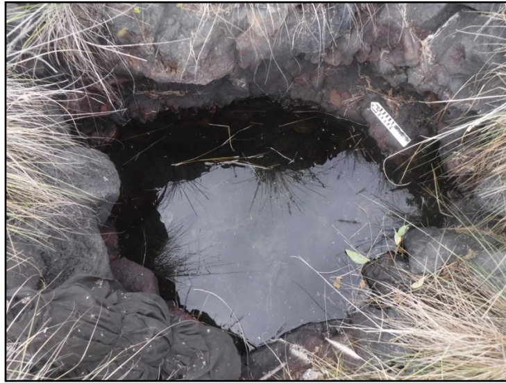
Figure 14. Southern pool, S-10 (left), at a tide level of +1.43'.