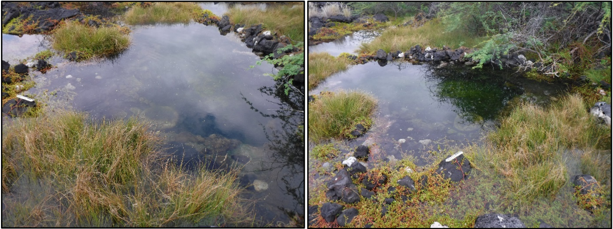
Figure 6. Northern pool N-3 at tide level +1.71'.