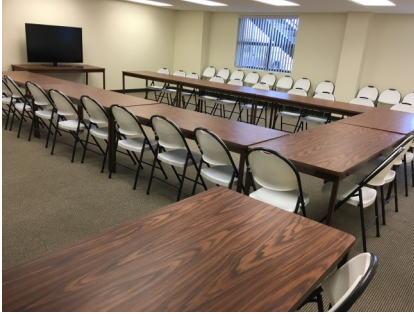
Meeting Room Space