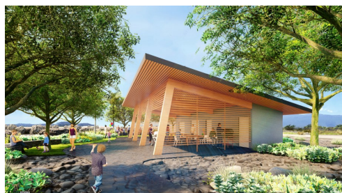
Renderings of Visitor Center (lower) and Innovation Village (upper) courtesy of WRNS Studio.