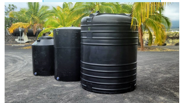
New LMI manufacturing location at the North 90 (upper) and tank products (lower).